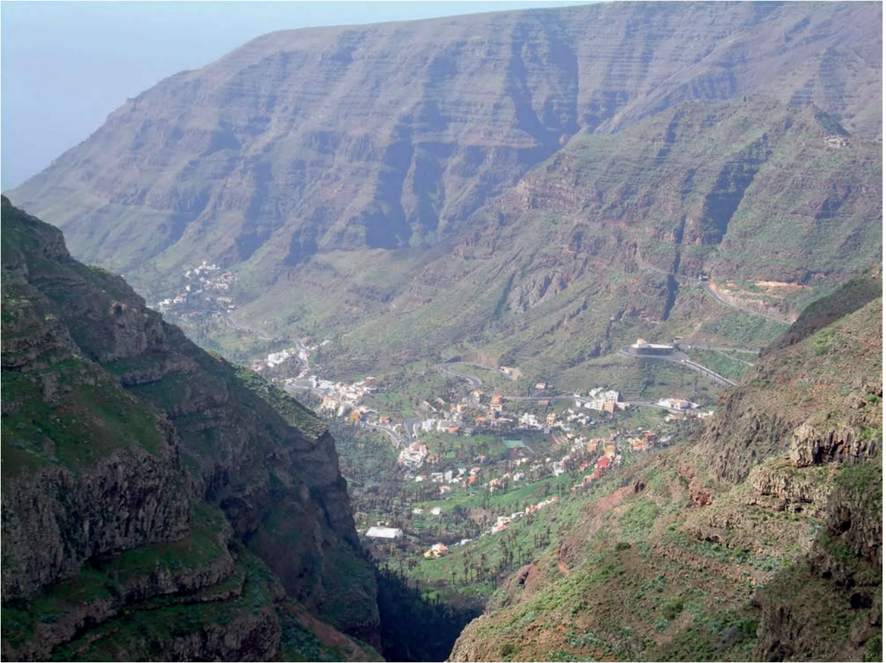
Photograph B for Question 6